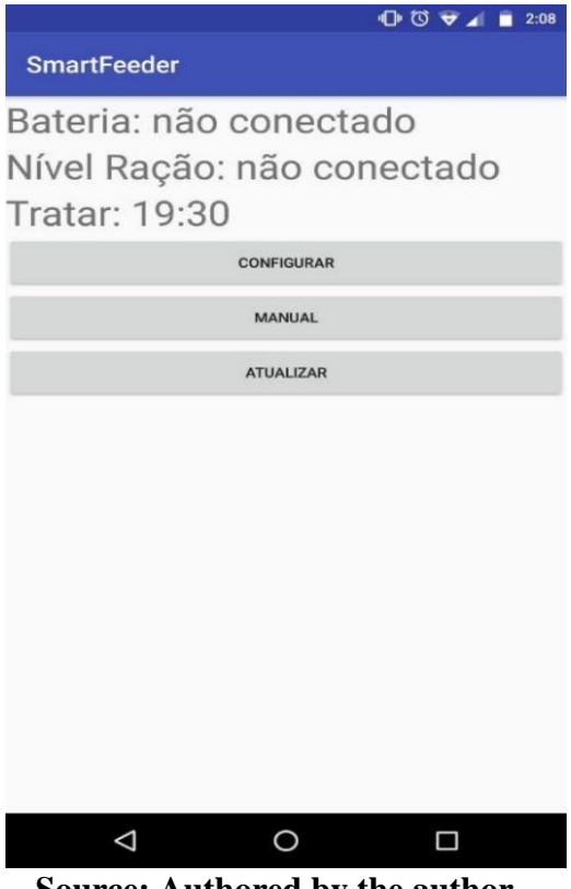
Figure 4: Main screen.