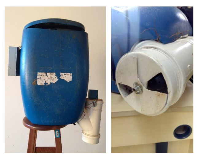
Figure 1: a) Side view of the feeder. b) View of feeder output.

As the objective of this work is to propose a cheap solution for the automatic feeding of animals in rural areas, the feeder was built using a 50 liter plastic barrel, which is used as a storage container for the feed. At the base of the barrel, a Y PVC (Polyvinyl chloride) pipe was used as an outlet for the feed to be poured into the water. This pipe has a cover that can be opened or closed by a servo motor, the same used in satellite dishes. The whole mechanical part of the project was developed with scrap material. Figure 1 a) shows the side view of the physical structure of the feeder, while Figure 1 b) shows the output of the feeder.