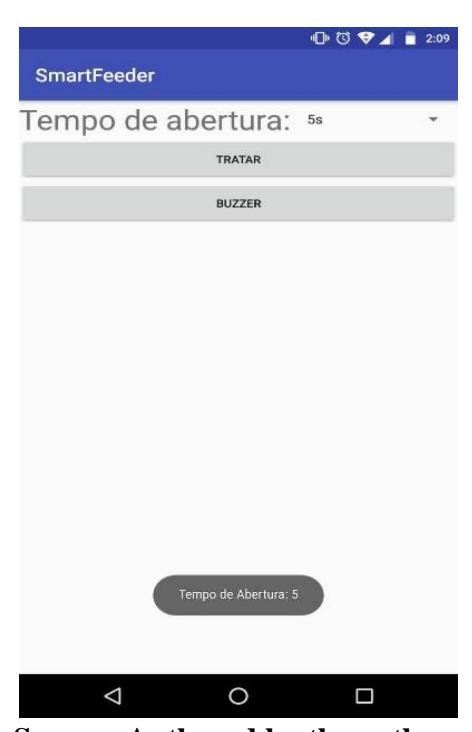
Figure 6: Screen for manual feeding and buzzer activation